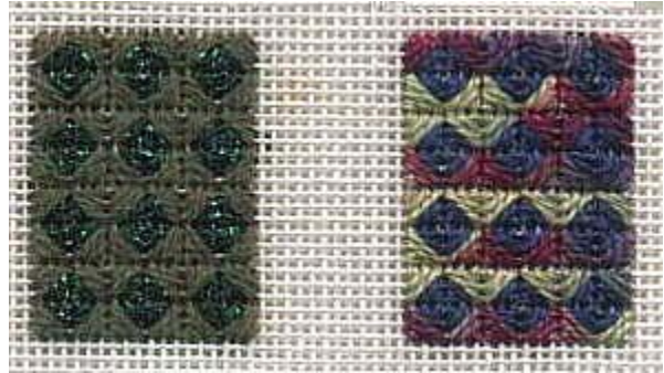
Sample Stitched by Carole Lake

Take a look at the diagram: there are light stitches and dark stitches. I would work all the dark stitches first, then fill in the light stitches. I used two thread combinations. The left sample is Medici wool for the dark stitches and Gold Rush 14 for the light stitches. The right sample is Watercolours for the dark stitches and pearl cotton for the light stitches.